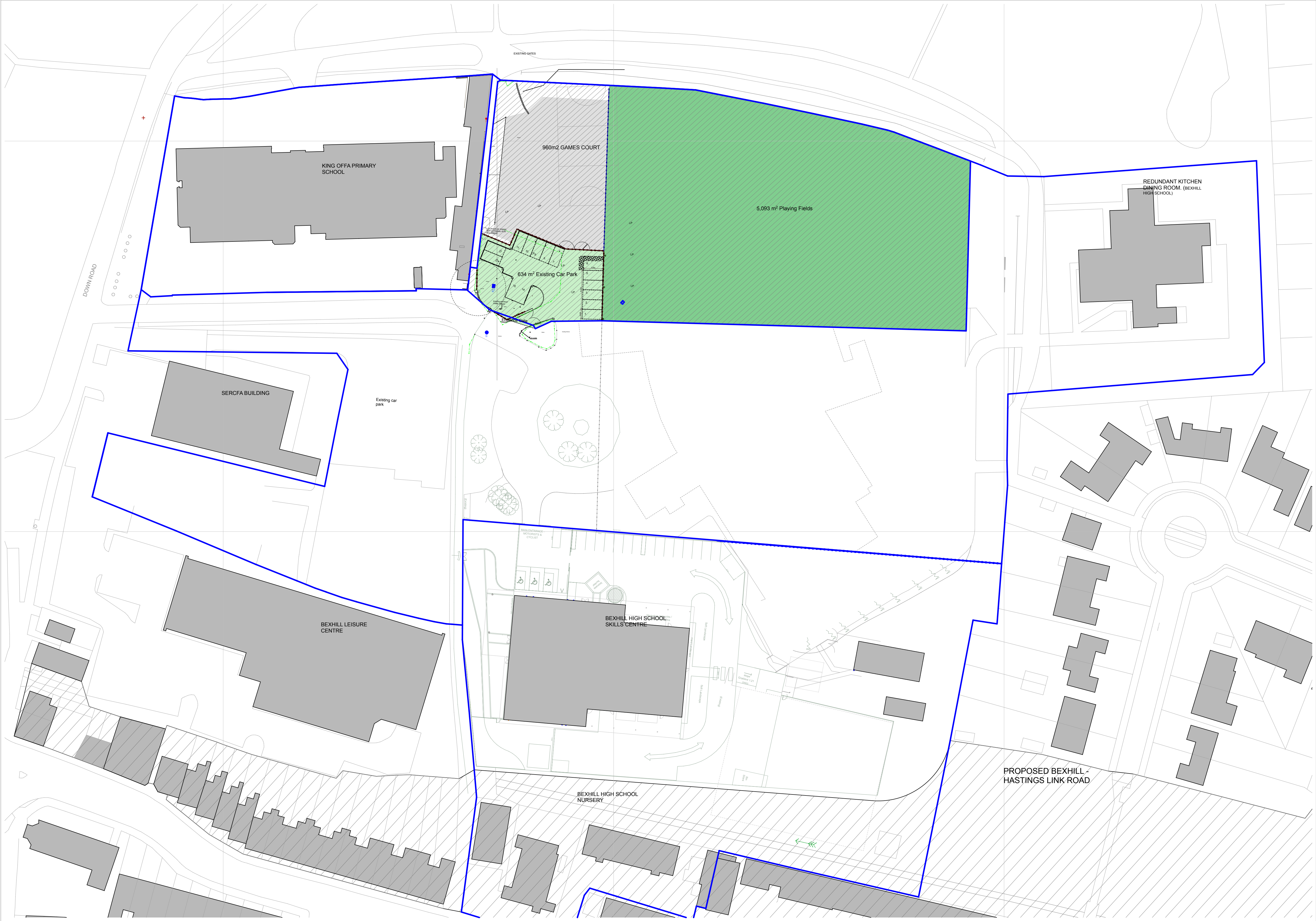
Existing Site Plan.....Scale 1:500 @ A1